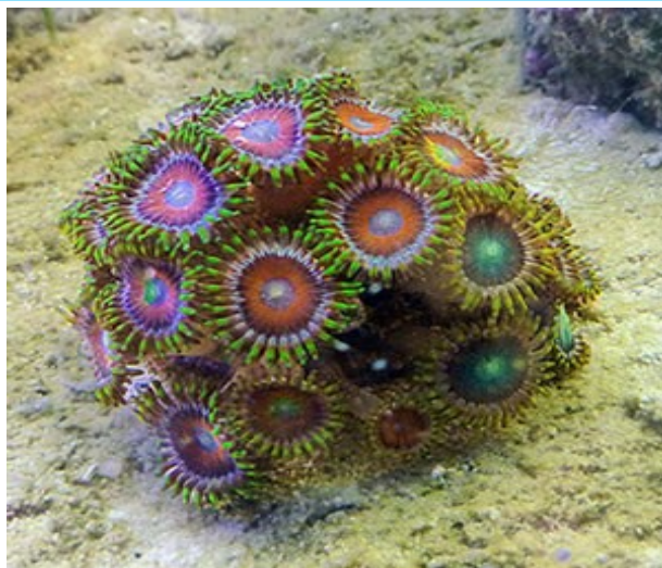
LIVE PETOSKEY CORAL