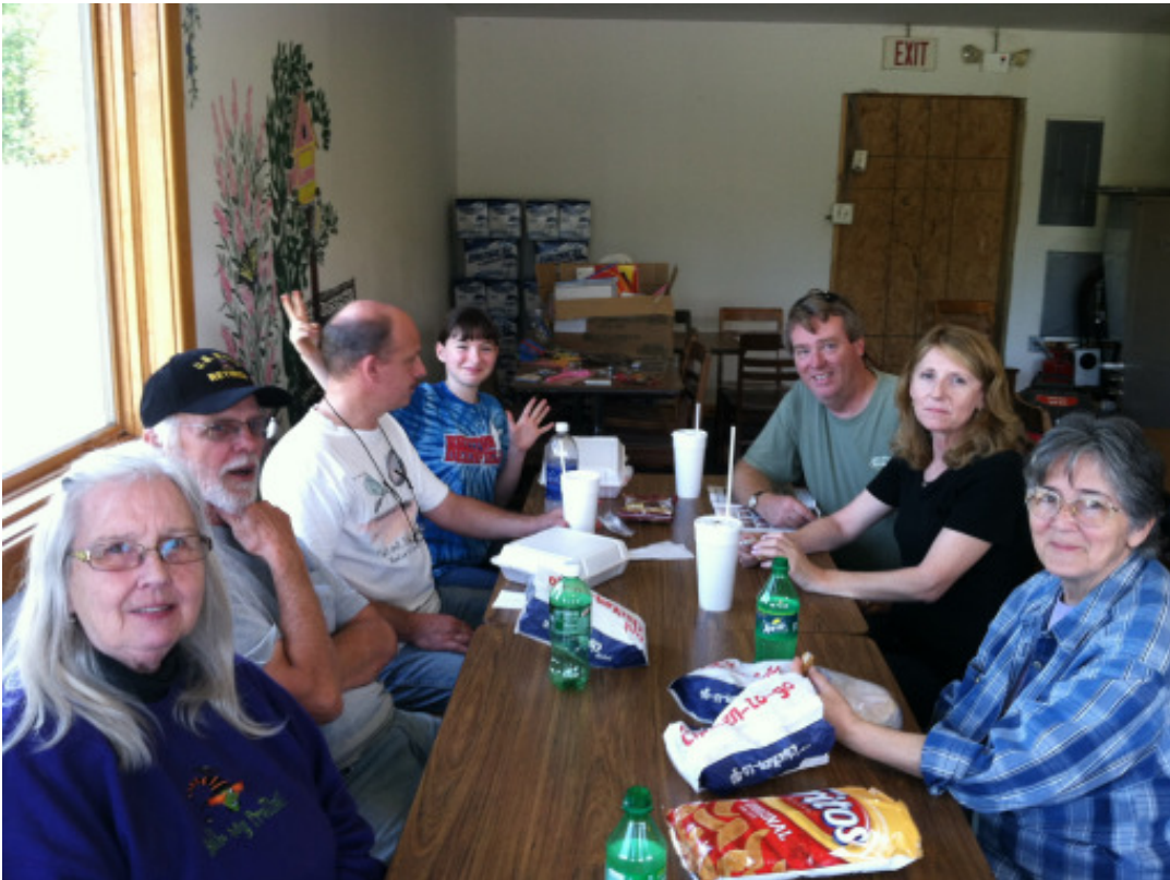
This is a photo of the group having breakfast